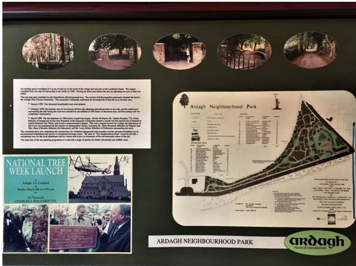
Ardagh Neighbourhood Park Information Board

Photographs of the Ardagh Neighbourhood Park information board in the Ardagh Heritage Centre, including photographs of the opening day event.