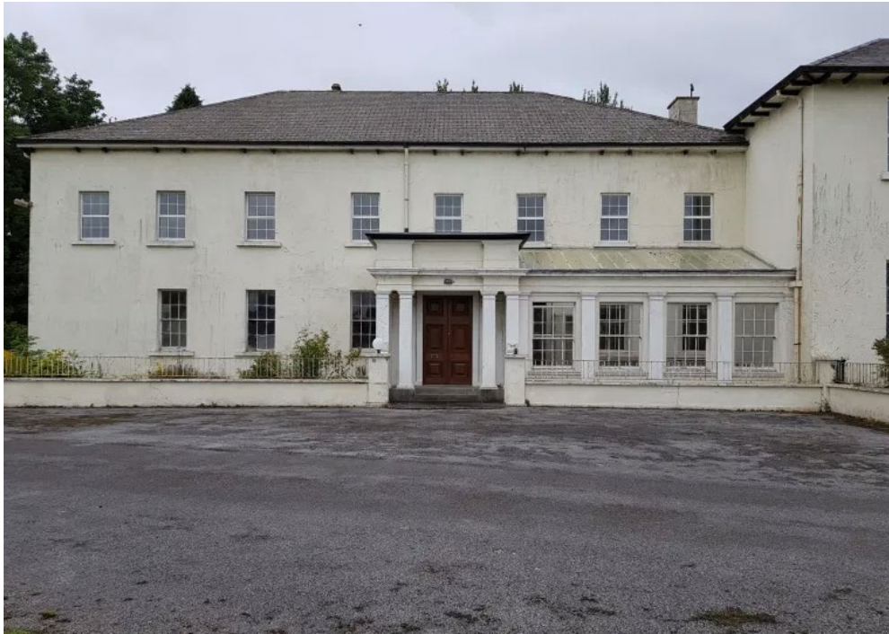
Exterior of the front of Ardagh House