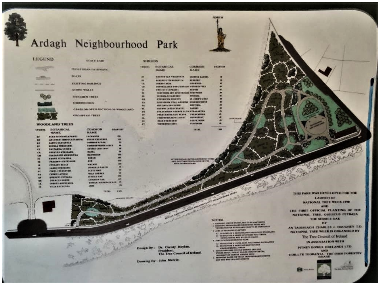
Close-up of the map of the Ardagh Neighbourhood Park

An existing spruce woodland of 4 acres of land lay to the north of the village and was part of the Landlord's Estate. The mature woodland area was ripe for harvesting in the winter of 1989. Having cut down and cleared the area an adjoining one acre of land was added.