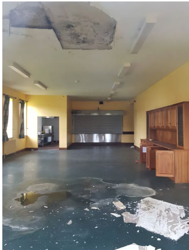
Interior room of Ardagh House